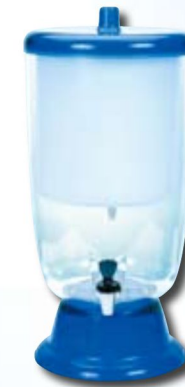
Clearware 6L 1 x Standard Ceramic Cartridge