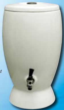
Porcelain 10L 2 x Standard Ceramic Cartridge

NOTE: Porcelain Gravity Purifier comes without the option for a CZR cartridge.