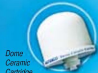
Dome Ceramic Cartridge

Waterco Ceramic Cartridges are made of micro-porous ceramic material, internally coated with an antibacterial treatment of Silver Nitrate. Within the Waterco Ceramic Cartridge is a Granular Activated Carbon Core.