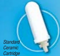
Standard Ceramic Cartridge