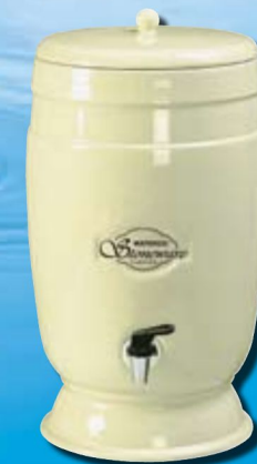
Stoneware 8L 1 x Standard Ceramic Cartridge

NOTE: Porcelain Gravity Purifier comes without the option for a CZR cartridge.